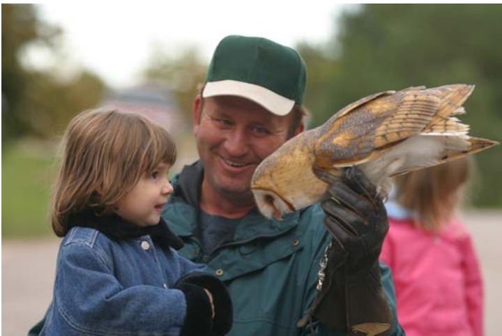
Miles in 2002

You can adopt Miles and get an annual membership to Eagle Valley Raptor Center for just $30.