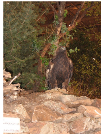
Above: Talon, an 11-year old golden eagle, poses on a rocky outcropping at the Wichita Garden Show.

If you missed the Garden Show this year, you can check out the virtual tours available at wichita360.com .